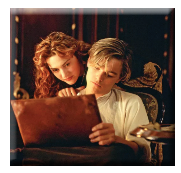
Above is a scene from the 1998's "Titanic."

For films, we can take a look at none other than the vastly adored 'Titanic.' Topping the box office for thirteen weekends straight and bringing in over 600 million dollars, Titanic is now a certified classic. It swept the nation by storm and the Oscar's, as it took home eleven awards out of fourteen nominations. One of Disney's most acclaimed films was also released that year. On June 19, Mulan ended up making about 120 million dollars at the box office. More movies these graduates