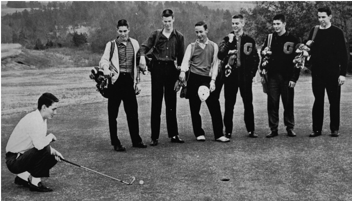
1959 GHS Golf Team

came a key part of fashion throughout time. Speaking of fashion... 1959 is a year filled with different fashion statements that are still present in today's trends. Plaid skirts and button-up shirts were a popular trend, along with fitted dresses