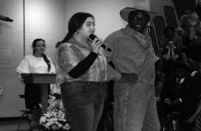
Students perform at the 2018 homecoming assembly.